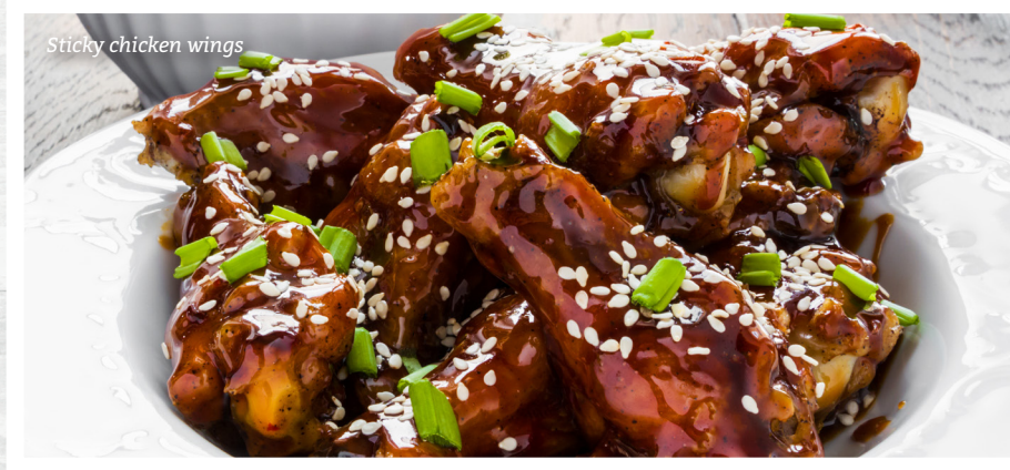
Sticky chicken wings